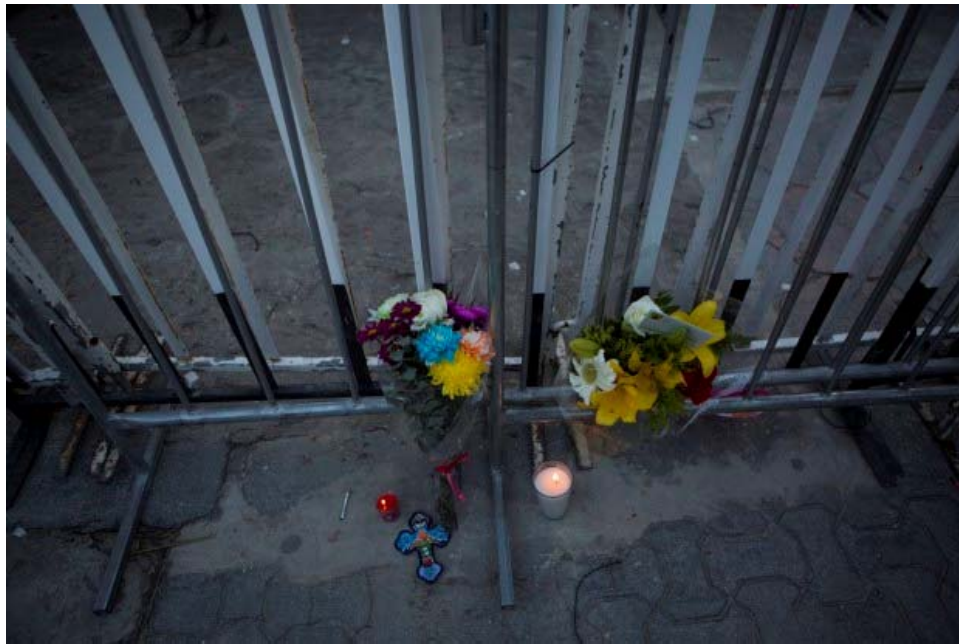
Flowers, candles, and a cross are placed outside barriers blocking the entrance to the Blue Parrot.

The shooting occurred near the largest exit, setting off chaos as concert goers had to scramble over a metal fence to escape to the beach.