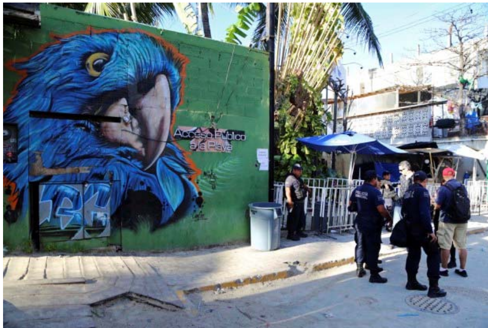
Police guard the entrance of the Blue Parrot nightclub in Playa del Carmen, Mexico, on Monday.