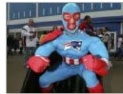
Send In Your Patriots Fan...