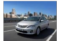
Top 10 Best-Selling Cars Of...