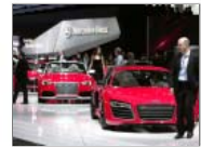
Detroit Auto Show 2013