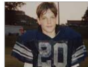
Wes Welker: The Early Years