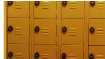
Suburban Student Murdered in Mexico: Report