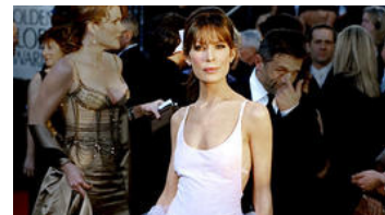
Golden Globes Fashion Faux Pas