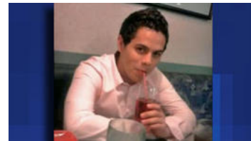
Memorial Planned for Teen Killed in Mexico